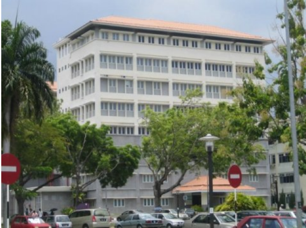
Plate 3.1: School of Computer Sciences, USM